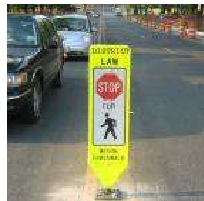
Work Zone Signs